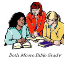
Both Moore Bible Study

Ladies Bible Study starting Sun., Sept. 13th from 5:30pm-7pm in the Cornerstone Hall. Beth Moore's Beloved Disciple: The Life and Ministry of John . Purchase your workbook at Lifeway Christian Store for $14.95. Come join us for fellowship and bible study! Hope to see you there!